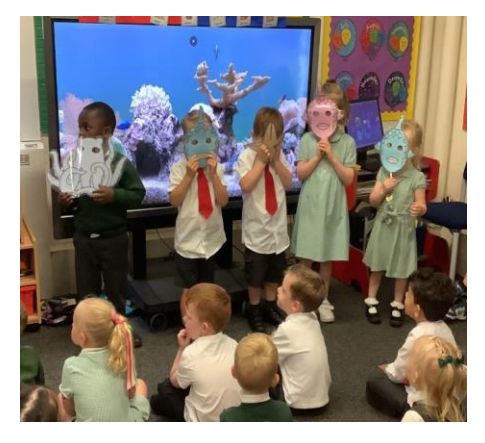
On Thursday Reception learnt how to write a diary entry, linked to their story of The Rainbow Fish.