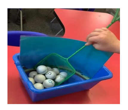
Year 1 have been exploring the importance of exercise for their bodies.