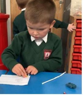
EYFS had a visit from the dental nurse! She taught us how to brush our teeth properly and what to eat to stay healthy ...