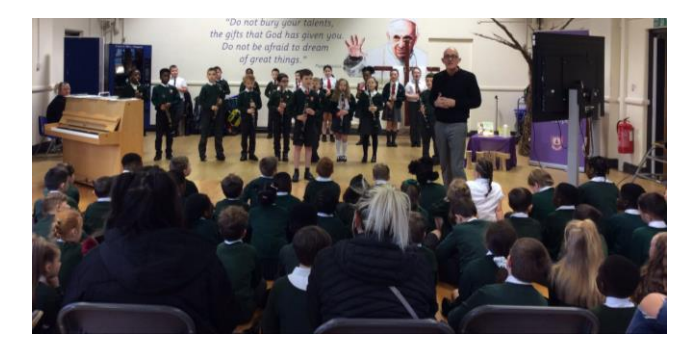
5M celebrated all things poetry on World Poetry Day!