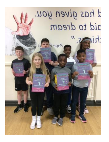
Well done to our winners this week!