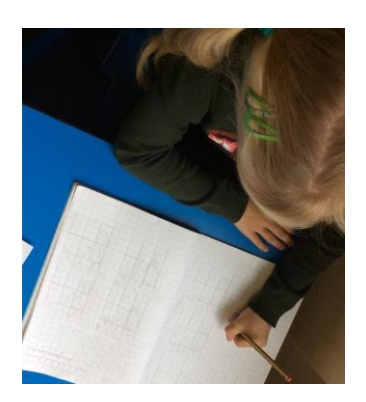
Year 5 have been working with negative numbers ...