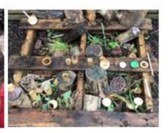
Y1 have been planting bulbs and seeds. We look forward to seeing what grows in the next few weeks